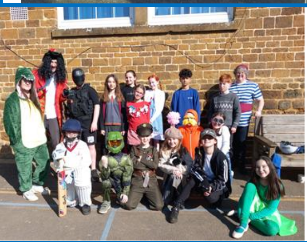
Willow Class, Peach Tree and Rowan Class