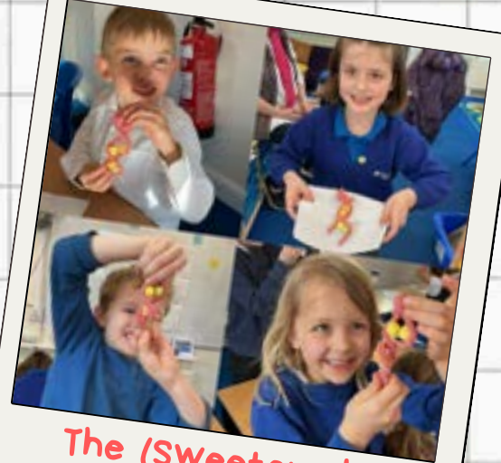
The (Sweetened) structure of DNA

We have had a brilliant time learning about people who have changed the world - Florence Nightingale, Mary Seacole, Rosalind Franklin, and Sarah Gilbert. We made Florence's lamp, the double helix structure of DNA, and extracted DNA from a strawberry! We now know all about these amazing, influential women and their fascinating lives.