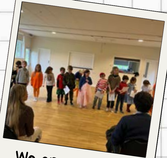
We are actors...

Willow Class have really enjoyed learning about natural disasters this term. We have studied the destruction of Pompeii in 79AD, the Krakatoa eruption of 1883, and the Boxing Day Tsunami of 2004.